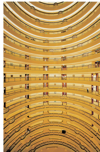
Andreas Gursky (Filling)